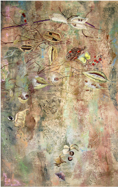
Seeds Mixed Media 66" X 42" Gretchen Ebersol 2009